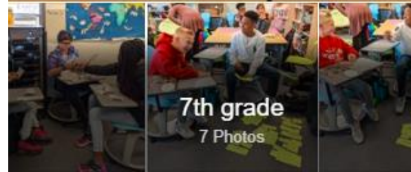
7th grade 7 Photos