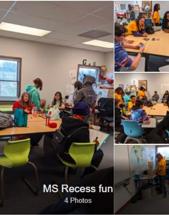
MS Recess fun 4 Photos